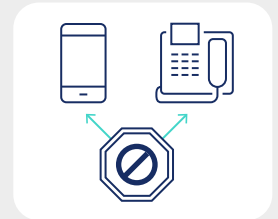
Block Fraudulent Calls

Learn how TNS Call Guardian can help you protect your subscribers from abusive, fraudulent and unlawful users. Contact us today to learn more.